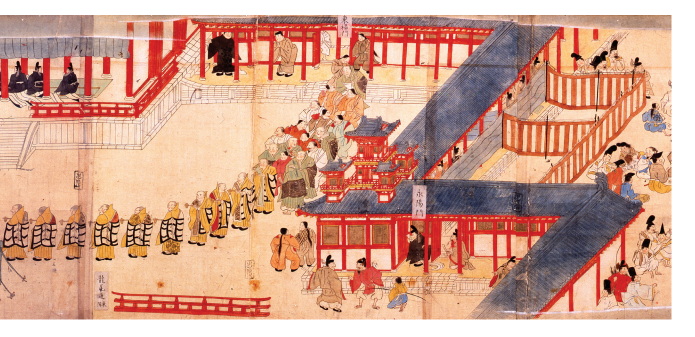
Figure 1 Picture Scrolls of the Annual Rites and Ceremonies of the Imperial Court (Nenjū gyōji emaki), detail of the Misaie ceremony in the Imperial Palace, painted copy of 12th-century work, dated 1626, by Sumiyoshi Jokei (1599–1670), handscroll, ink, and color on paper, Tanaka Collection.

The arrival of the monk Kūkai in 806, however, altered the dynamic of Buddhist ceremony at the imperial court. Kūkai brought with him the practices of Esoteric Teaching ( mikkyō ) that he had studied during a two-year stay in the Tang capital of Chang'an, and he established the Shingon sect, involving many ritual paradigms and paraphernalia new to Japan, including the use of painted mandalas and large ensembles of gilt-bronze implements. As institutionally vested as the Misai-e rite was, Kūkai managed to persuade the court to expand the New Year Buddhist ceremonies to include a new concurrent Esoteric Buddhist rite called the Mishuhō ceremony.³ Kūkai argued that the incantation and lecturing of the Golden Light Sutra in the existing ceremony was insufficient, and that, for the sutra to be most efficacious, paintings of the deities and altars for their worship had to be built and employed in specifically esoteric rituals. In other words, he made the case for the crucial role of visual images and for an interactive engagement with them in the efficacy of ritual, an argument that would have an indisputably significant impact on the development of Buddhist art in Japan.⁴ Kūkai was instrumental in establishing a building dedicated to esoteric ritual within the palace compound known as the Mantra Chapel (Shingon'in), thus securing the presence of Esoteric Buddhist rites physically within the palace and temporally within the calendar of the annual observances of the court.