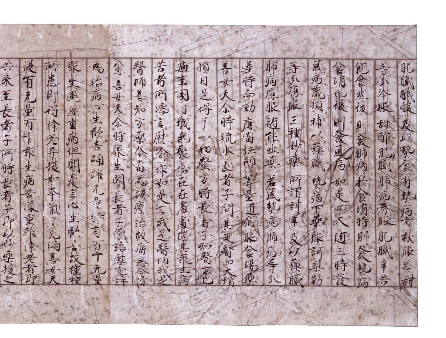
Figure 4 Golden Light Sutra (Konkōmyökyö), with underdrawings, known as the "eyeless sutra" (Menashikyō), 12th century, ink on paper, Kyoto National Museum.