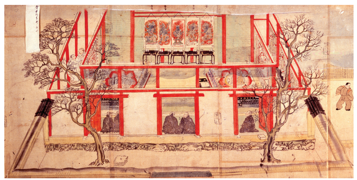
Figure 2 Picture Scrolls of the Annual Rites and Ceremonies of the Imperial Court (Nenjū gyōji emaki), detail of the Mantra Chapel (Shingon'in) in the Imperial Palace, painted copy of 12th-century work, dated 1626, by Sumiyoshi Jokei, handscroll, ink, and color on paper, Tanaka Collection.